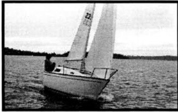
23 San Juan